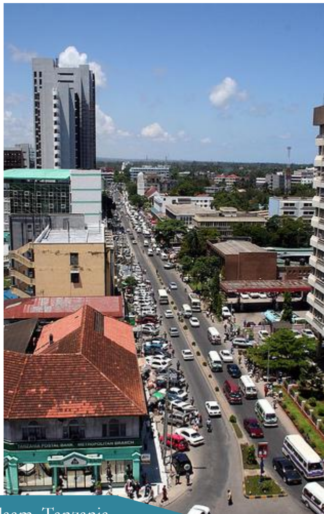
Dar es Salaam, Tanzania

support from the government, support services as well as educational facilities and the local hospital are often under staffed and facilities are often in desperate need of repair and renovation.