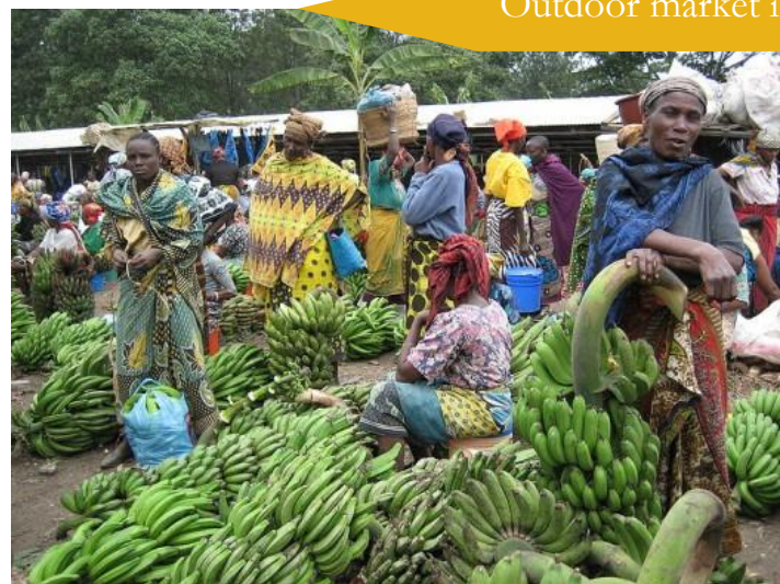
Outdoor market in Tanzania

First and foremost, participants should plan and pack according to the weather, climate and temperature. Recall that Karagwe has a tropical climate, but the high altitude tempers it. The annual average temperature is 26 degrees C (79 degrees Fahrenheit). June through August, the temperatures overnight can fall below 70 degrees Fahrenheit. You shouldn't bring any clothing with you that you would be hard pressed to leave behind. It is also important to remember that you are acting as "diplomats." While abroad, you represent not only yourself, but also your