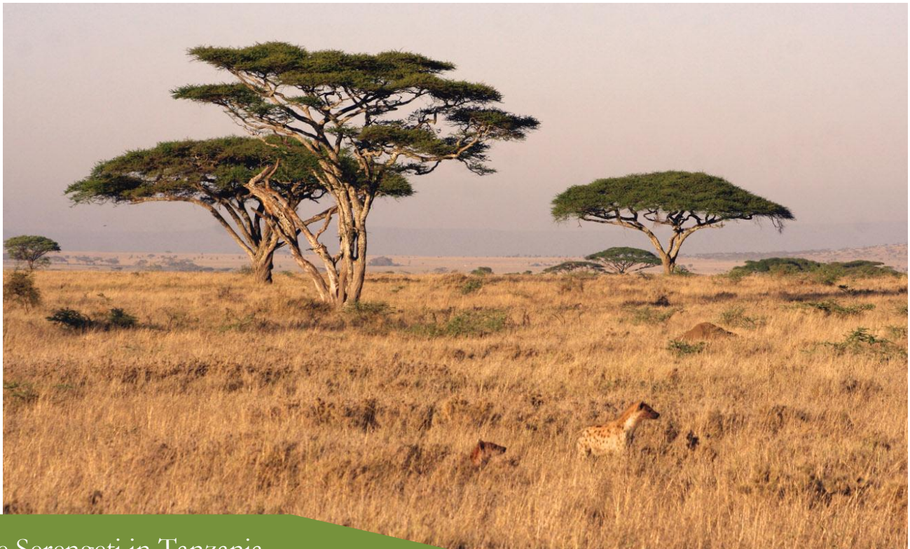
The Serengeti in Tanzania

Eating abroad is an adventure of new tastes, smells, and meals! Since you are living as part of the community, you will have the opportunity to try genuine local dishes. You may be eating the same or similar food regularly as is the local custom. In Tanzania, you will be eating plentiful amounts of freshly prepared foods including, several varieties of bananas, potatoes, peas, tomatoes, squash, peanut sauces, rice, eggs, meat, and delicious tea and fresh milk. Keep in mind that access to familiar Western foods is limited; if you are concerned with this, you may consider packing a few snacks!