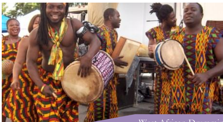
West African Drumming & Dancing

As a volunteer in the community, you will have local companions and friends. Volunteers should observe and imitate local customs regarding safety. Regardless of where you are it is best to travel in pairs, especially at night.