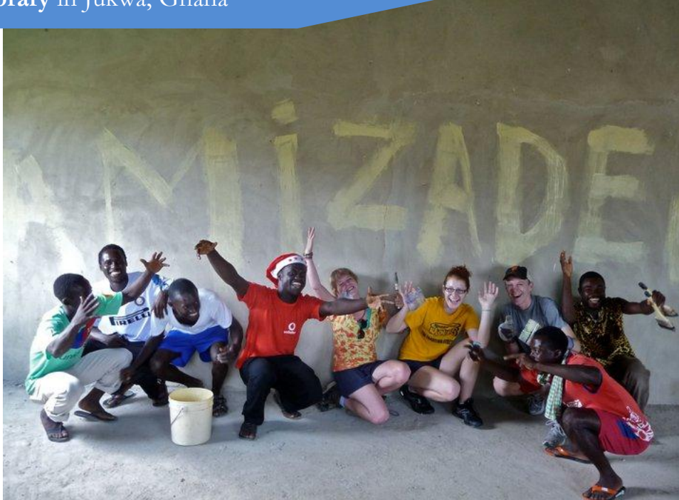
The library in Jukwa, Ghana

exchange rates and are generally up-to-date with the current international rates. It is very important to inform your bank that you will be using your card to withdrawal money while in Ghana. This will help to avoid them from issuing a "hold" on your card which prevents one from withdrawing money. As always, use common sense and care when using an ATM and planning the amount needed for your activities.